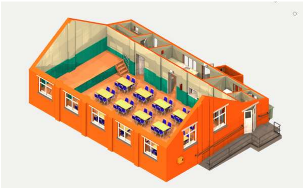
Figure 4 – Typical Table & Seating Arrangement For 60 People