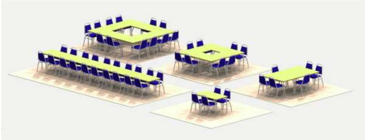
Figure 3 – Examples of Various Table & Seat Layouts